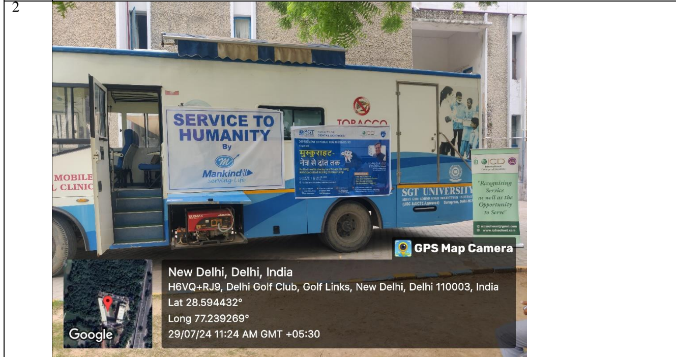
Mobile Dental Van at the location to cater oral health care needs of the attendees of the event.