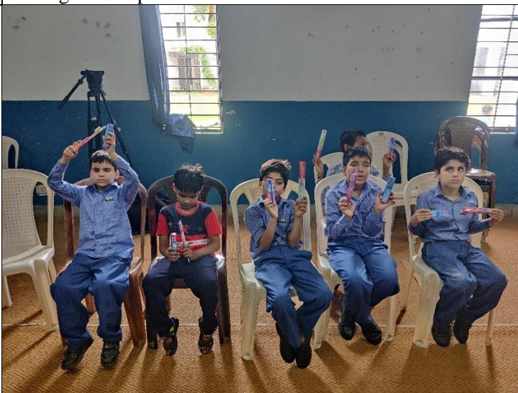
Distribution of oral hygiene aids to school children